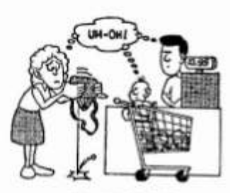
Distriction by Yory Builds.